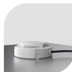
AIRMLED/POD/3NM/ST Emergency Pod fitted